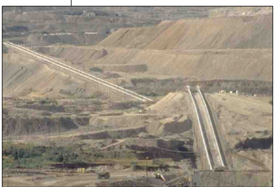
Highland Valley copper mine near Kamloops, BC

As explained below, this trend is part of a