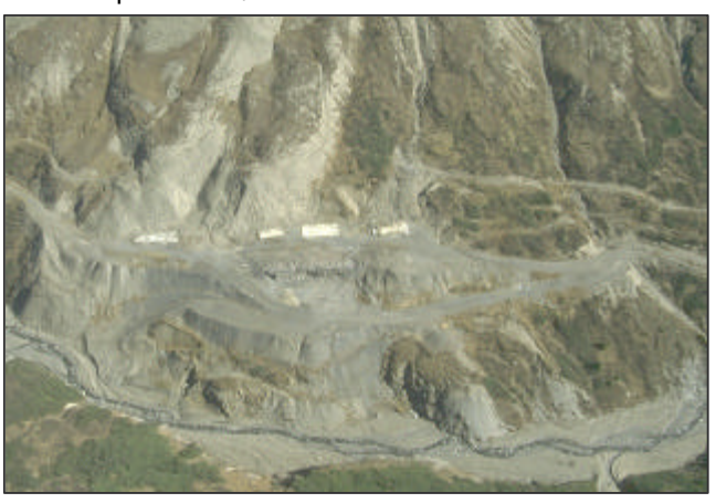
Exploration camp and access roads

restructuring tenure to consider other land use priorities,