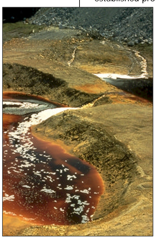
Acid mine drainage is a serious threat to surface and groundwater

from mineral development. Impacts can range from the degradation of water or air quality to the loss of important wildlife corridors and destruction of critical habitat areas.