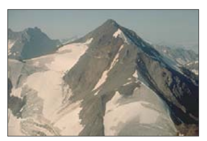
Windy Craggy, once site of a proposed copper mine and now in the Tatshenshini-Alsek World Heritage Site

Rights to public resources such as mineral claims are contractual in nature; and are received subject to limitations which are inconsistent with traditional views of the