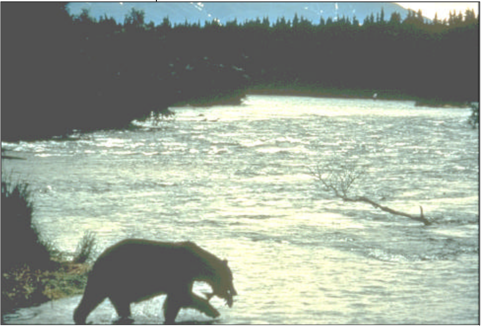
Protection from habitat disruption and water contamination is critical for long-term ecological health