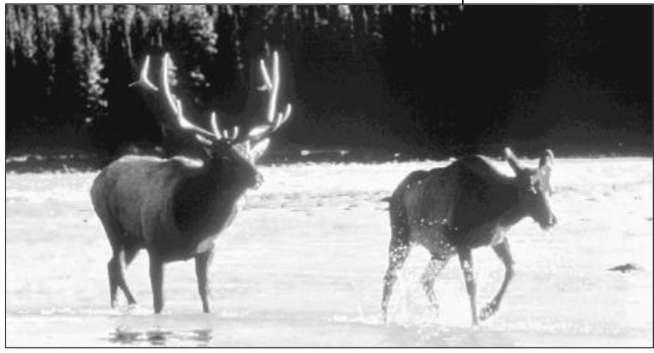
Caribou and other wildlife species are vulnerable to roads, habitat loss and other mineral development impacts

Setting up this network of protected areas, and ensuring that the lands and waters around them are also