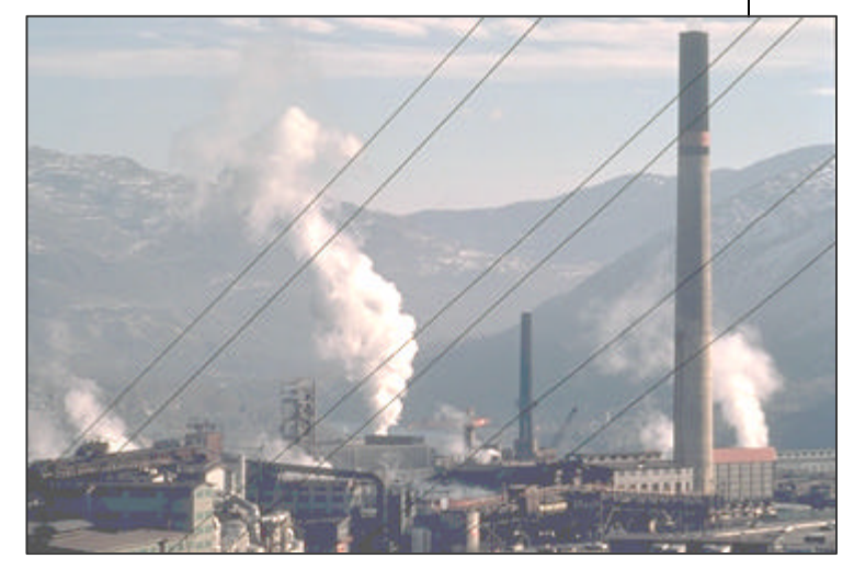
A mine is more than the hole in the ground... It is the center of a web of developments.

mineral development must be assessed in light of substantial requirements for power, water and transportation routes.