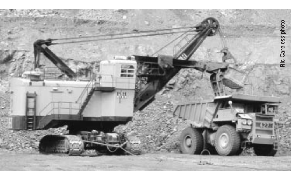
Increased mechanization yields increased mine waste management.

One of the problems is that mining has become more mechanized and therefore able to handle more rock and ore material than ever before. Consequently, mine waste has multiplied enormously. As mine technologies are developed to make it more profitable to mine low grade ore, even more waste will be generated in the future. This trend requires the mining industry to adopt and consistently apply practices that minimize the environmental impacts of this waste production.